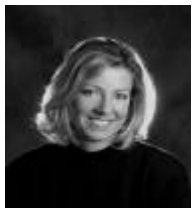
PAST PRESIDENT & CREW NETWORK DELEGATE: